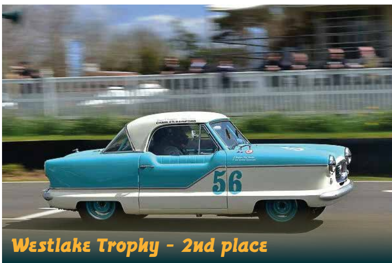
Westlake Trophy - 2nd place